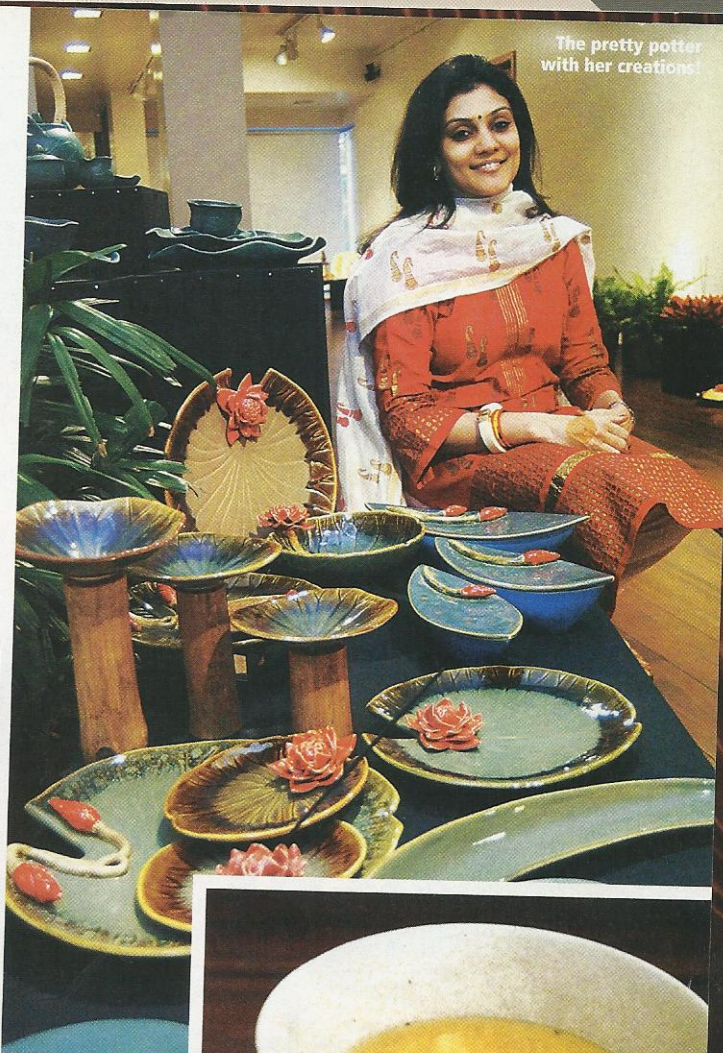
The pretty potter with her creations!