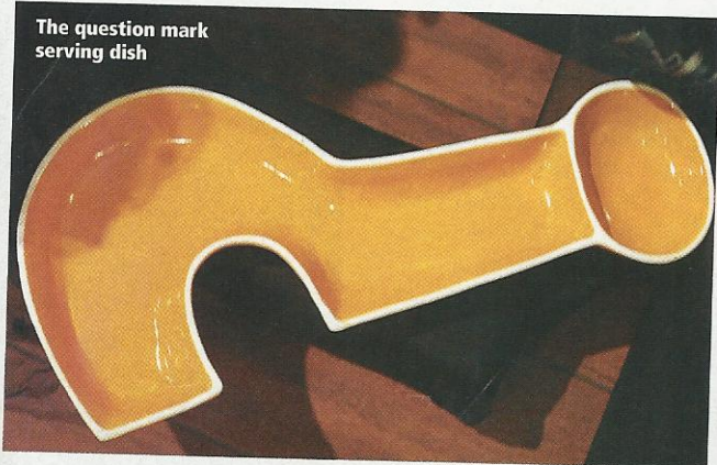
The question mark serving dish

What: 'Romancing the Clay With Five Elements', an exhibition of ceramics by Aanupamaa Jalan.